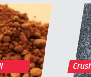
Crusher (Grannels) Sand